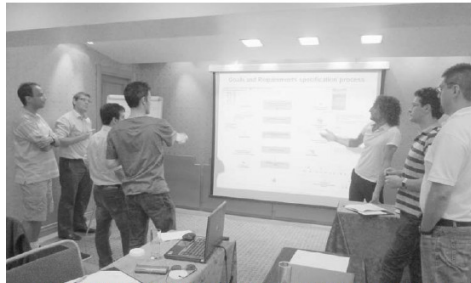
Sharing and communicating on complex technologies is not easy. OW2 can help you!

OW2 provides community support and dissemination services to open source collaborative projects