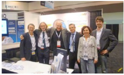
The Open Source Software Community for Collaborative R&D Projects